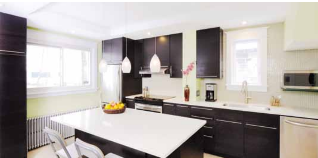
Conservation-minded renovators will often try to make better use of the existing space in a home rather than propose an expensive addition.

Engineered stone countertops, made of 93 per cent crushed quartz combined with polymer resins and pigment, seem to be a great option. Quartz is an abundant natural, often crumbly rock, too brittle to