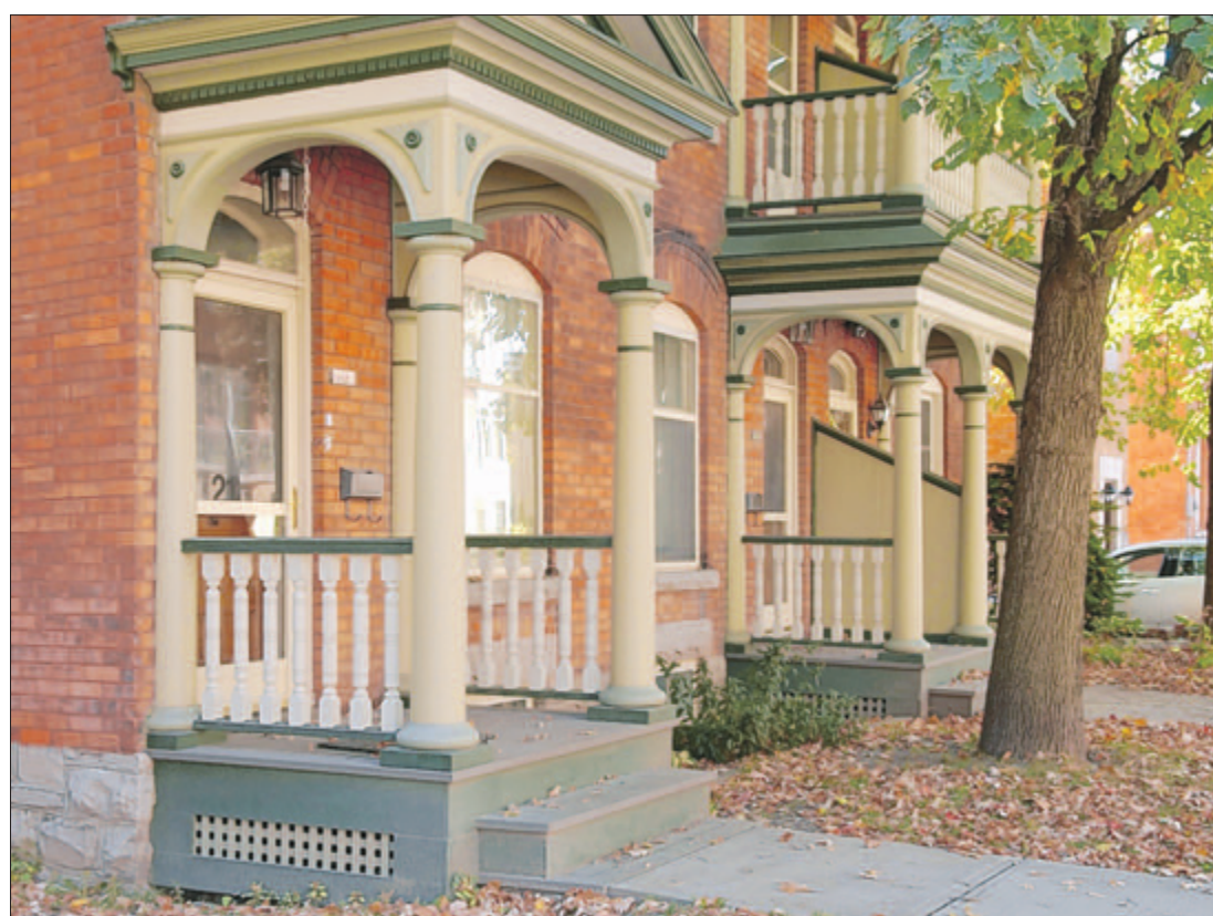
The Bolton Street porches feature columns, rosettes, flower petals, arches, coves and crowns, a project so excellently restored that it won a City of Ottawa architectural conservation reward.